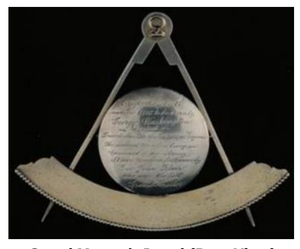
Grand Master's Jewel (Rear View)

I read again this engraving on the "Sun" at the center of our jewels: